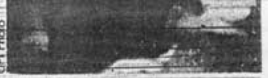
Policeman watches as gunman

The rapist has been described as white, between 20 and 30 years old. Fear of the man has touched off increased sales of guns, guard dogs and alarm systems throughout the area.